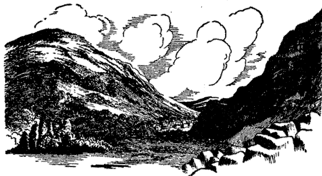
Mount Ebal and Mount Gerizim